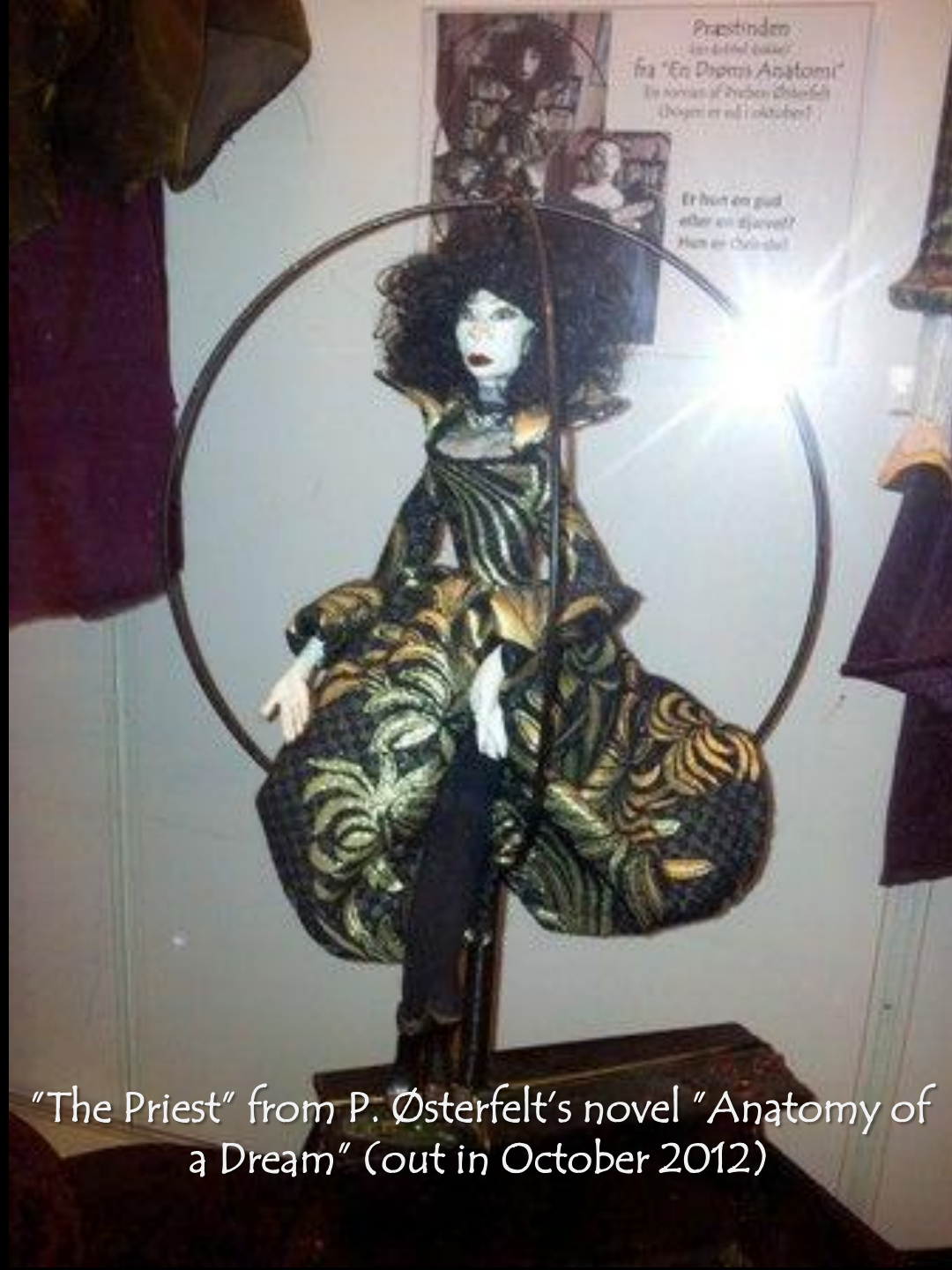
"The Priest" from P. Østerfelt's novel "Anatomy of a Dream" (out in October 2012)