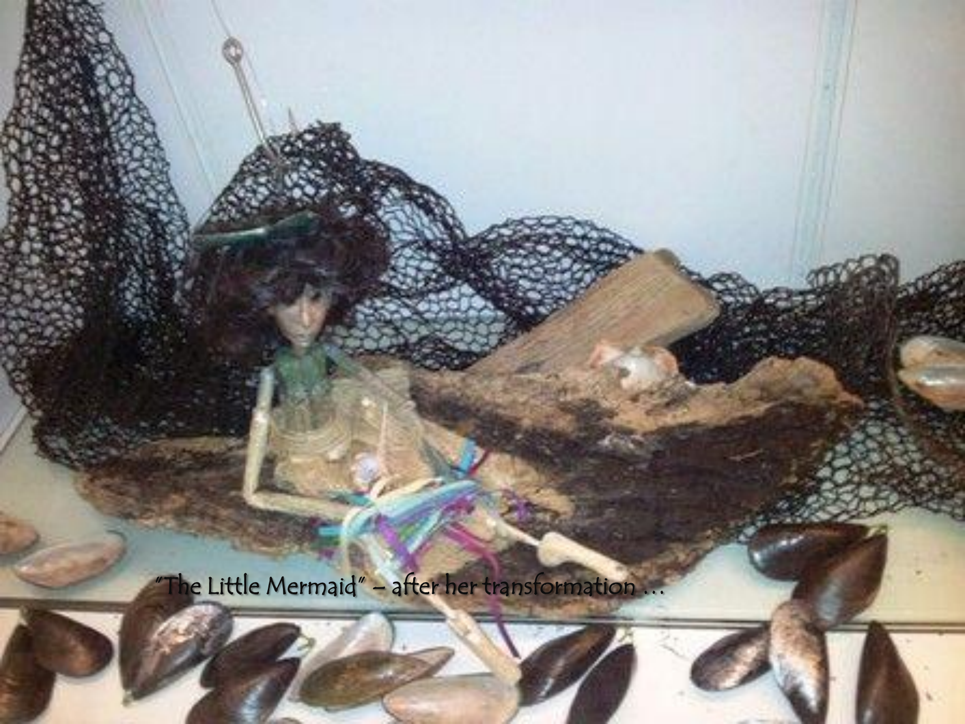
"The Little Mermaid" – after her transformation ...