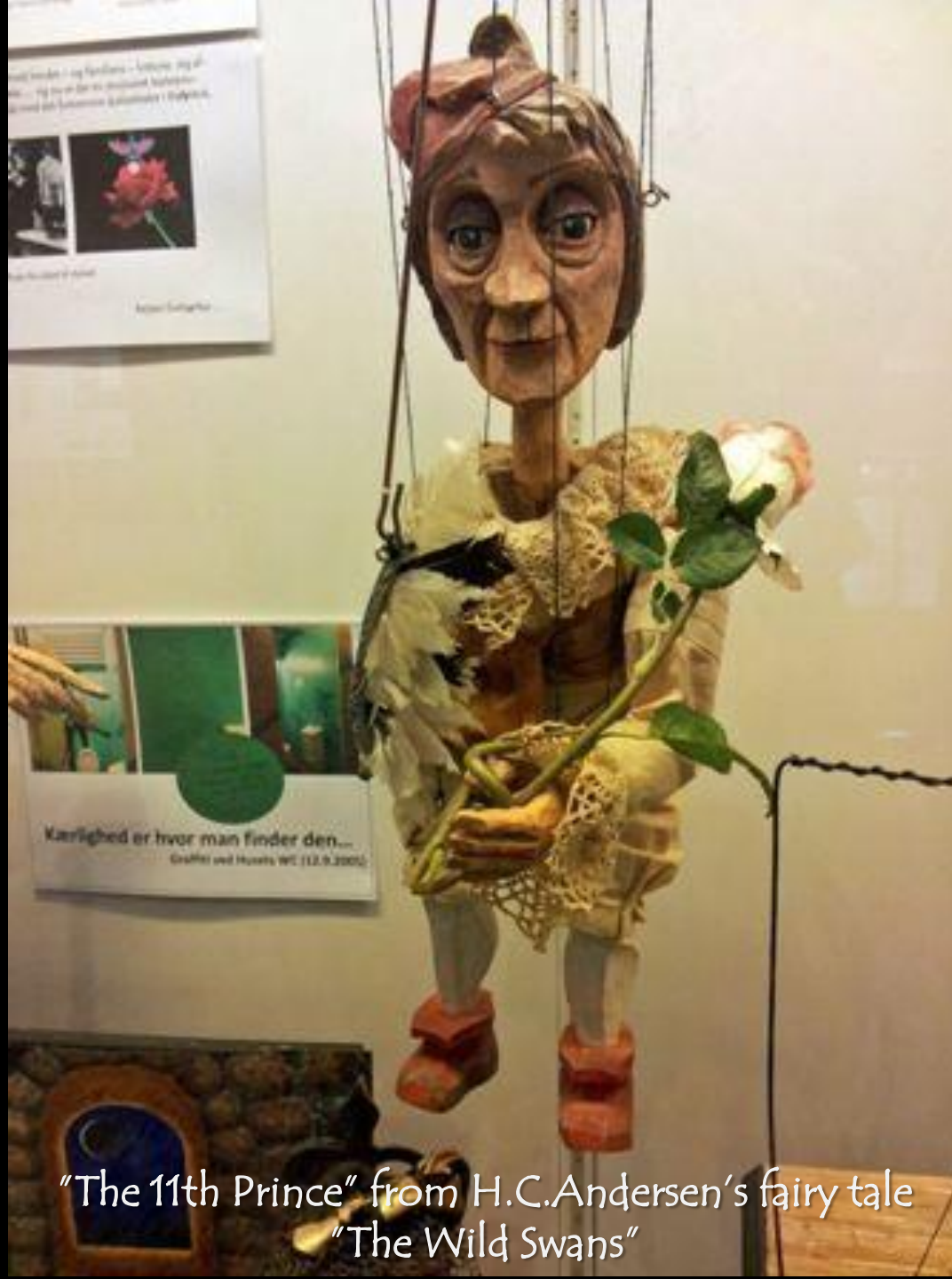
"The 11th Prince" from H.C.Andersen's fairy tale "The Wild Swans"