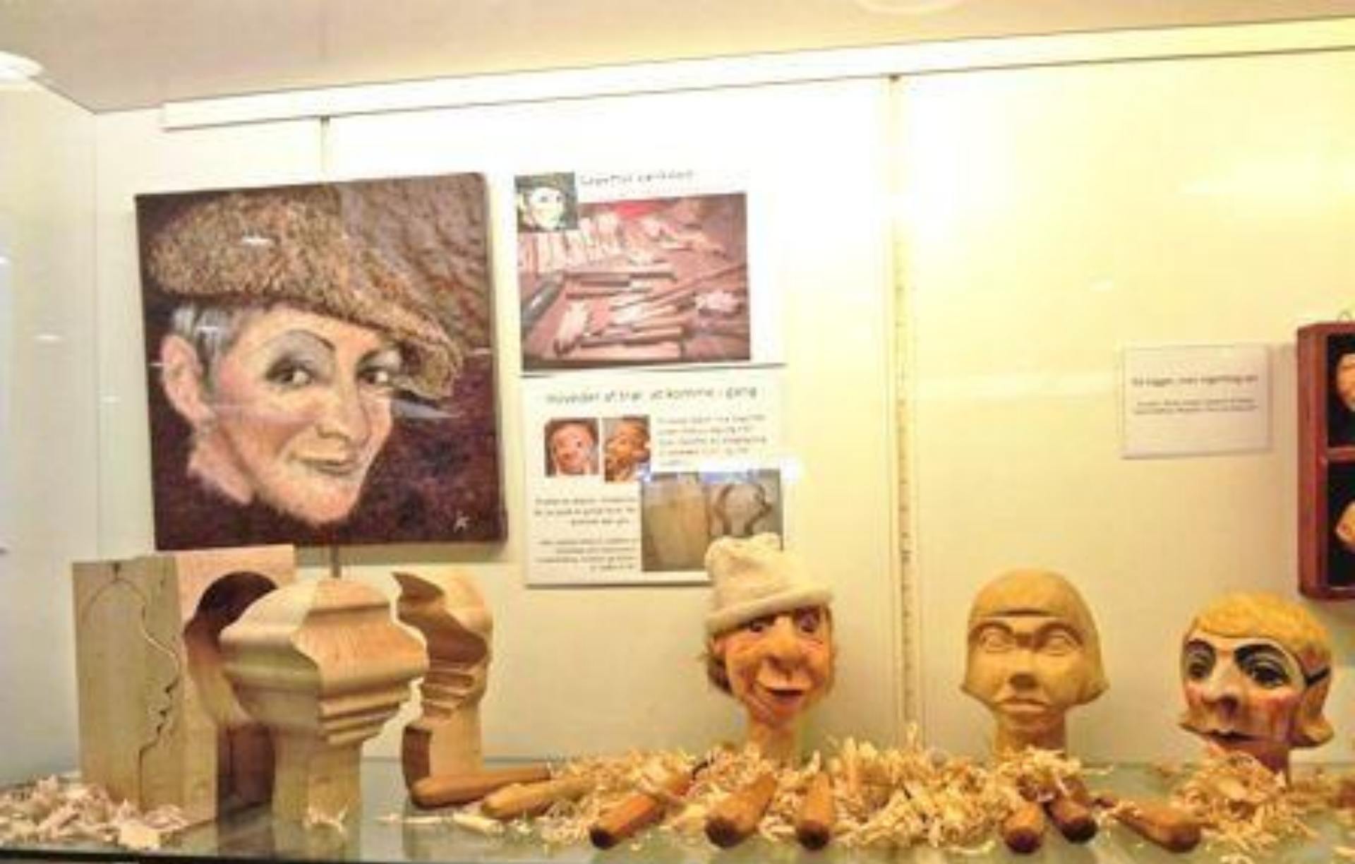
Gepetto's workshop – a creative chaos filled with wooden heads and wood chips everywhere ...