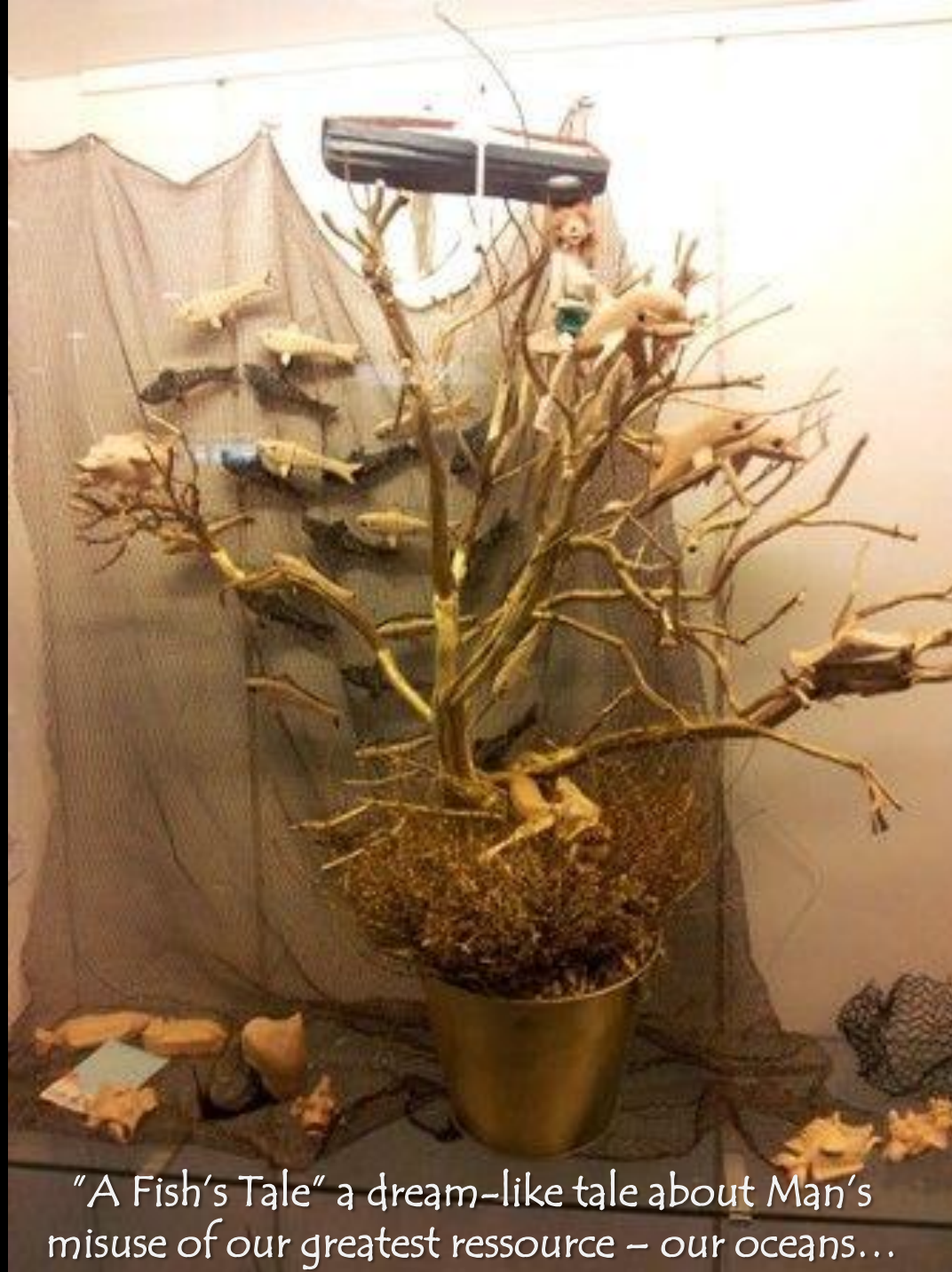
"A Fish's Tale" a dream-like tale about Man's misuse of our greatest resource – our oceans...