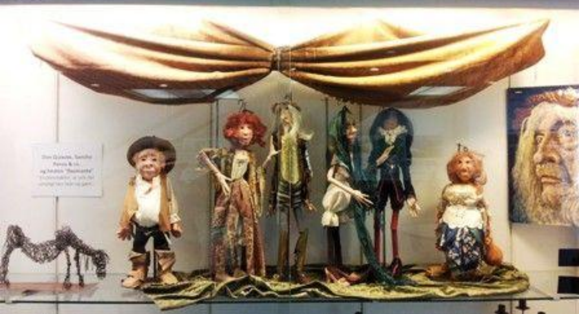
Don Quixote and Co. – and of course Rosinante the horse!