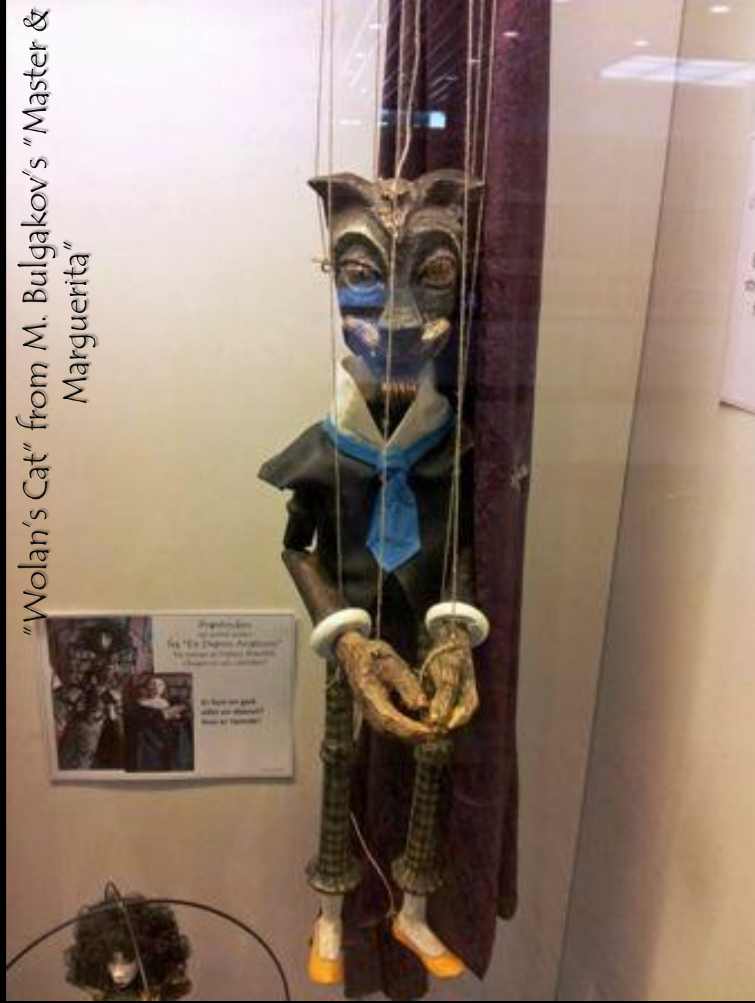
"Wolan's Cat" from M. Bulgakov's "Master & Marguerita"